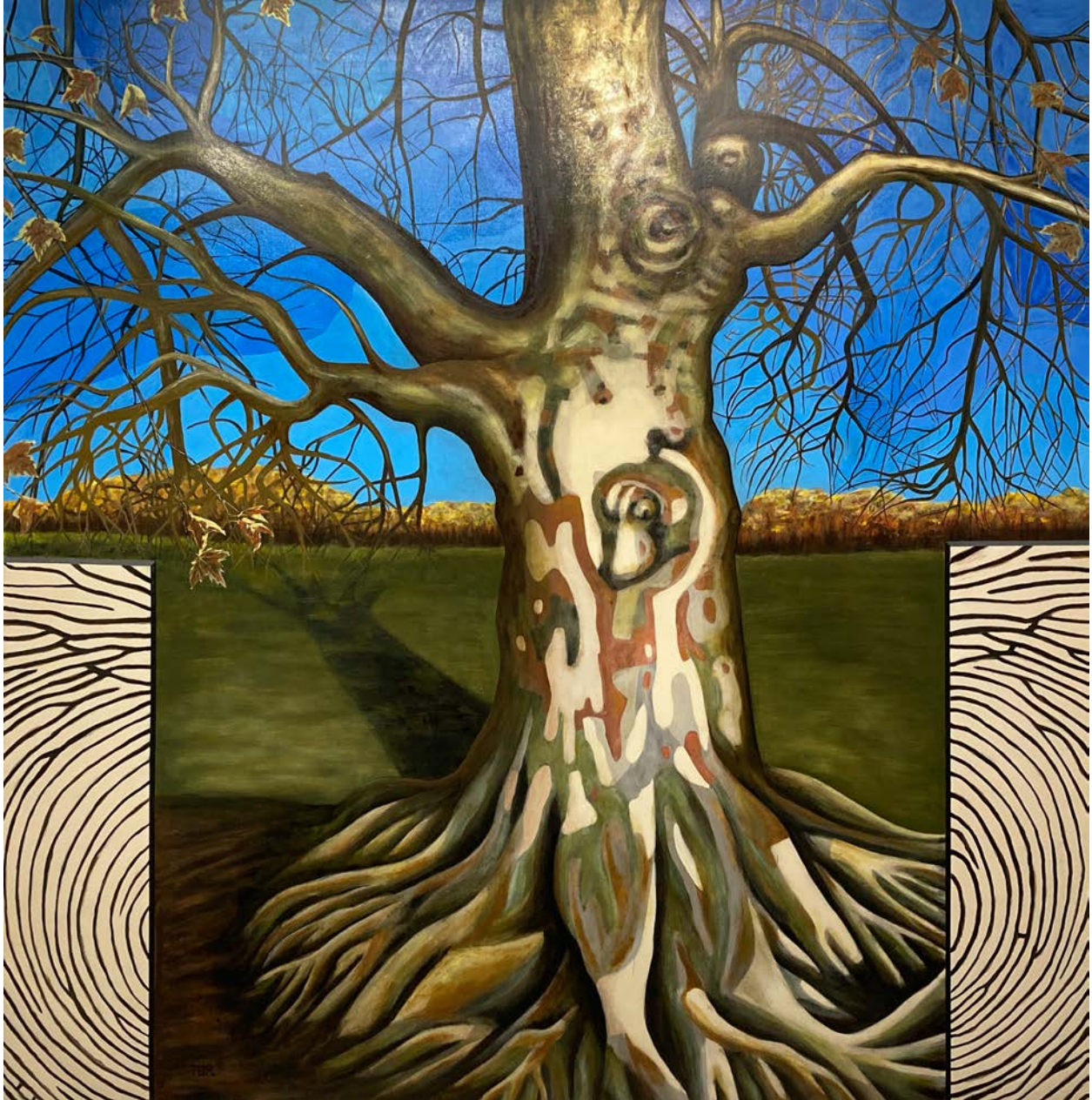
Todd B. Richmond Tree SMCP , 2021 oil on linen, 120 in. x 120 in.