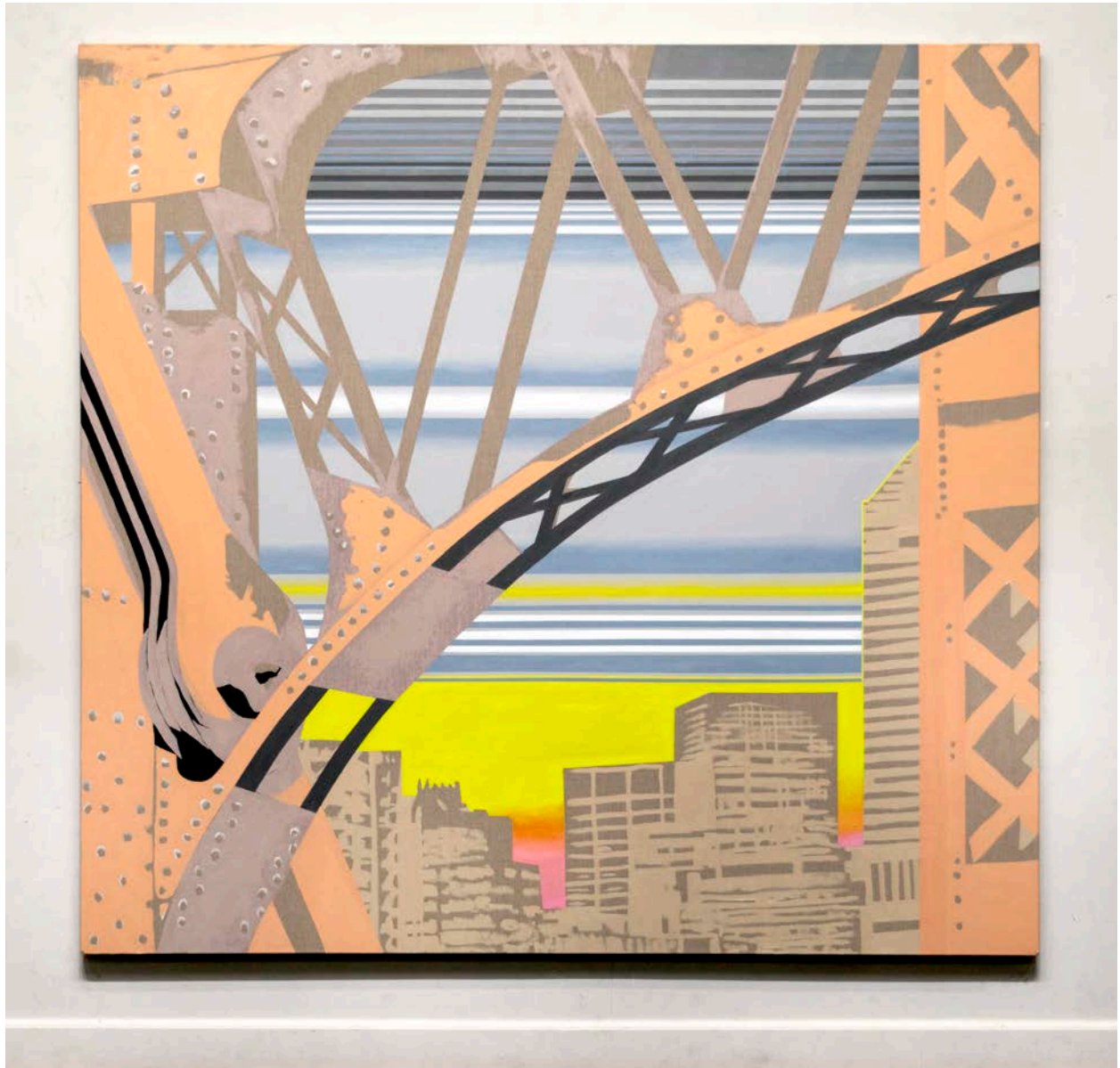
Todd B. Richmond QBB Westbound 02 , 2021 oil on linen, 72 in. x 68 in.