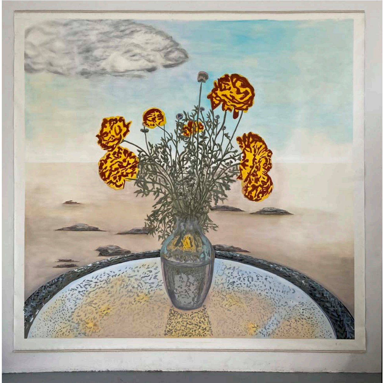
Todd B. Richmond Flowers in the Desert, 2021 oil on linen, 120 in. x 120 in.