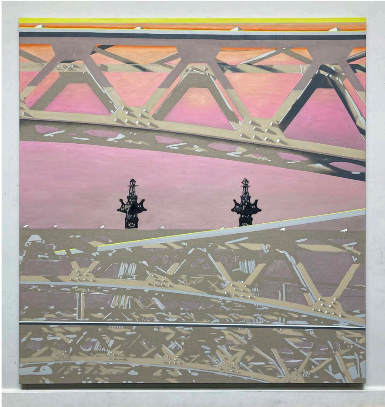
Todd B. Richmond QBB Dusk , 2021 oil on linen, 68 in. x 72 in.