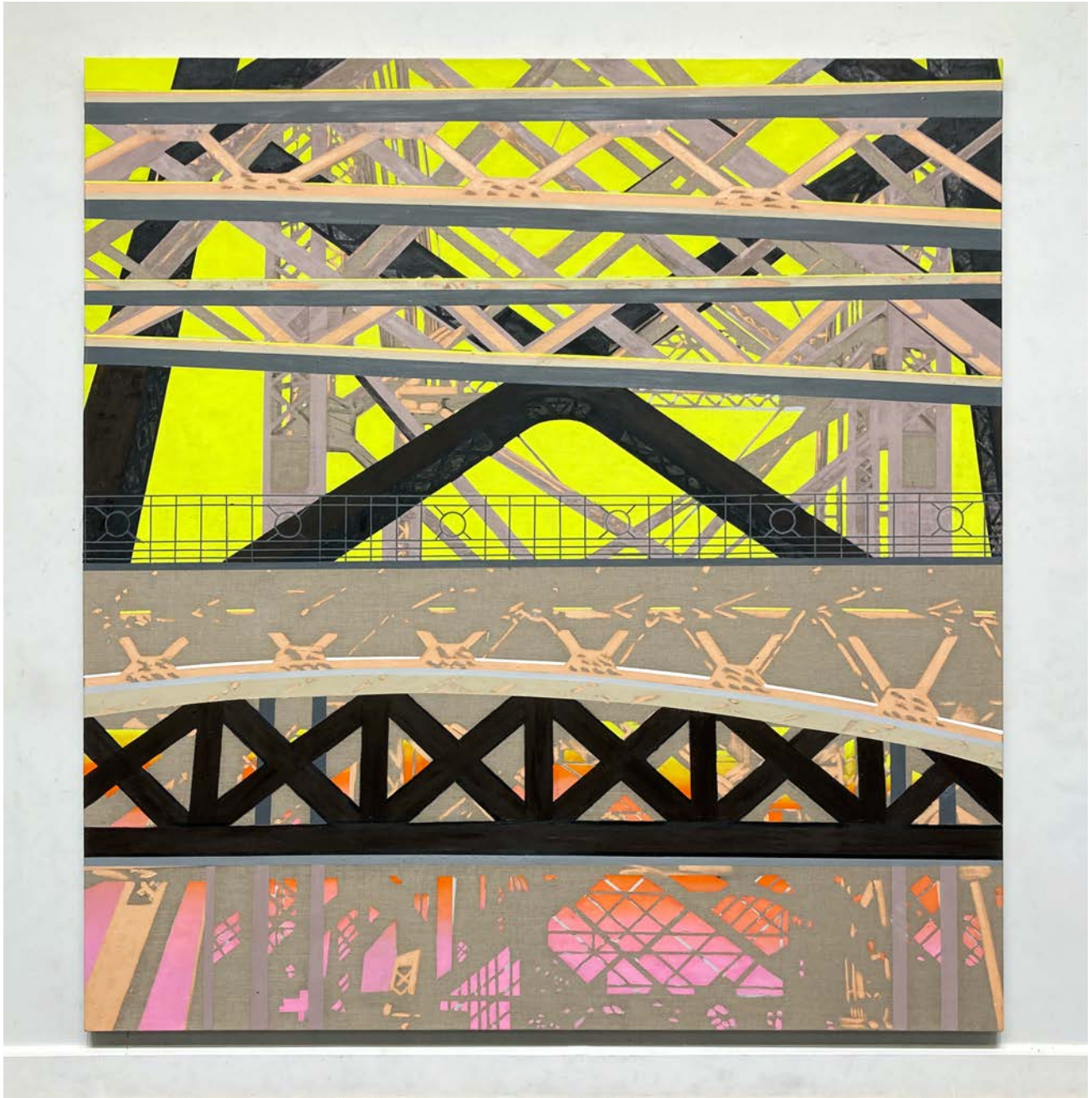
Todd B. Richmond QBB Dawn , 2021 oil on linen, 68 in. x 72 in.