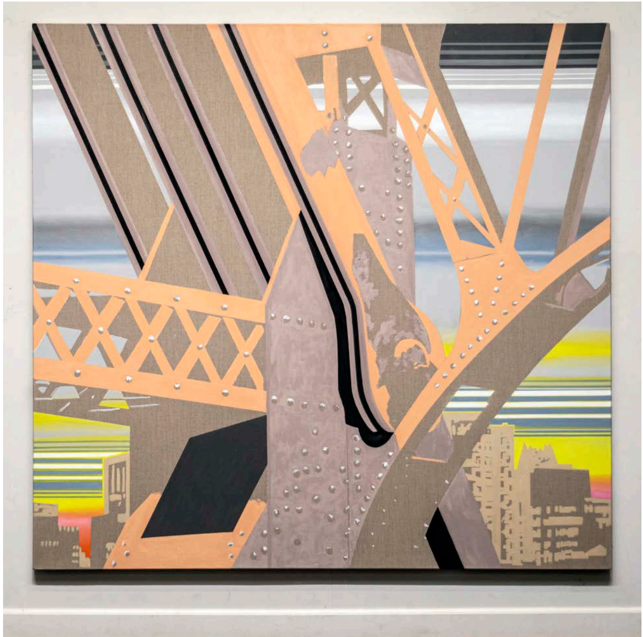
Todd B. Richmond QBB Westbound 01 , 2021 oil on linen, 72 in. x 68 in.