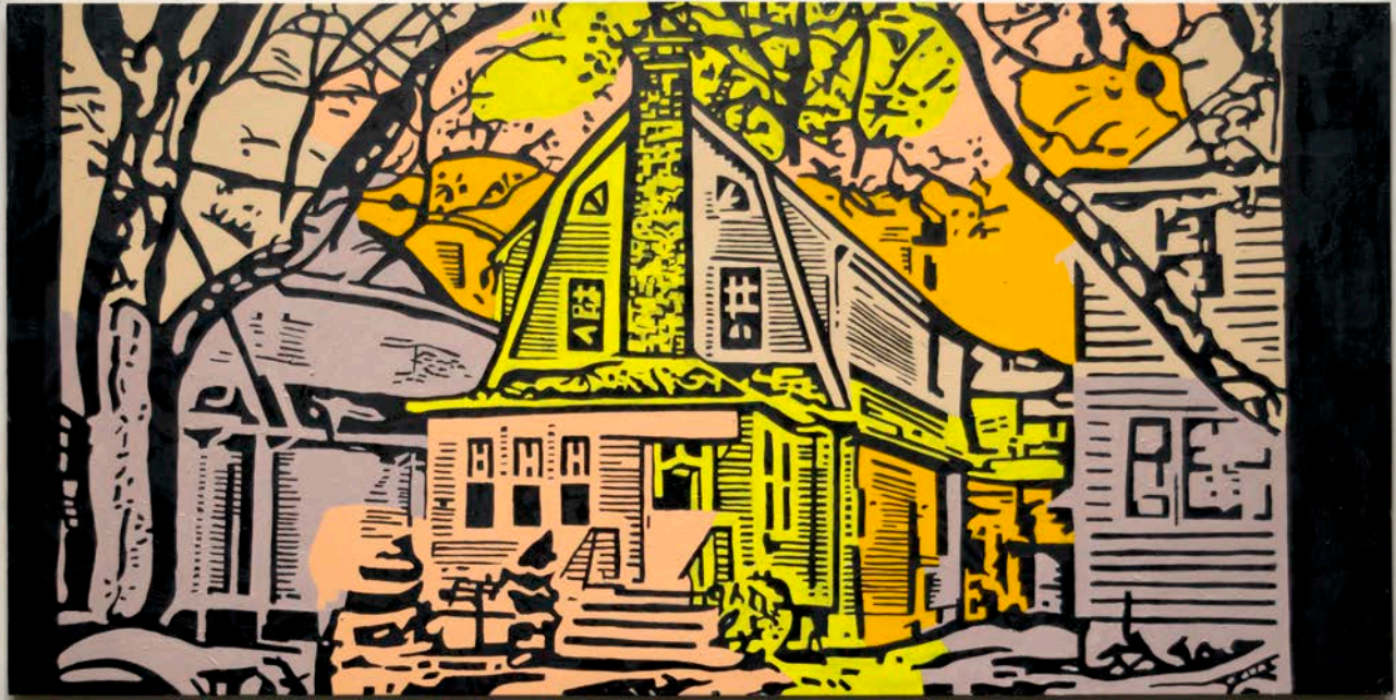
Todd B. Richmond Utopia, 2020 oil on canvas, 48 in. x 96 in. from the Queens Homes Series: home of Joseph Cornell