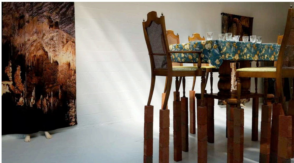
Pierre Ardouvin, Le couvert est mis (The table is set) , 2018. Exhibition view at Topaz Arts.